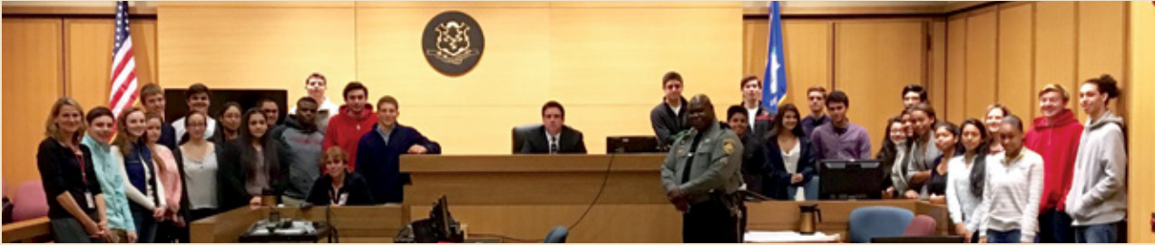
Connecticut Court Visitation Program participants at the Stamford Courthouse.

The Connecticut Court Visitation Program offers tours of geographical area courts to high school and middle school students throughout the state. Each tour consists of an explanation of court proceedings by a judge or member of the court staff, attendance at an arraignment session and an actual trial (if available), along with a question and answer session.