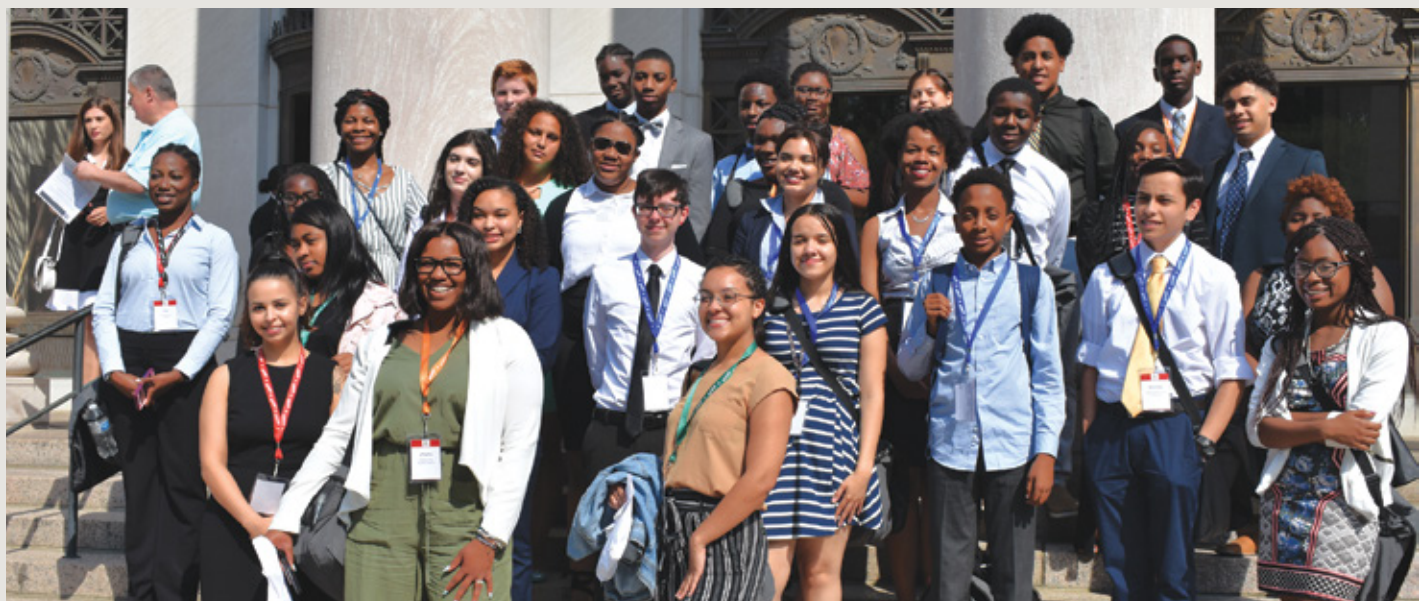
LAW Camp campers and their counselors outside of the Richard C. Lee United States Courthouse in New Haven after the final mock trial.