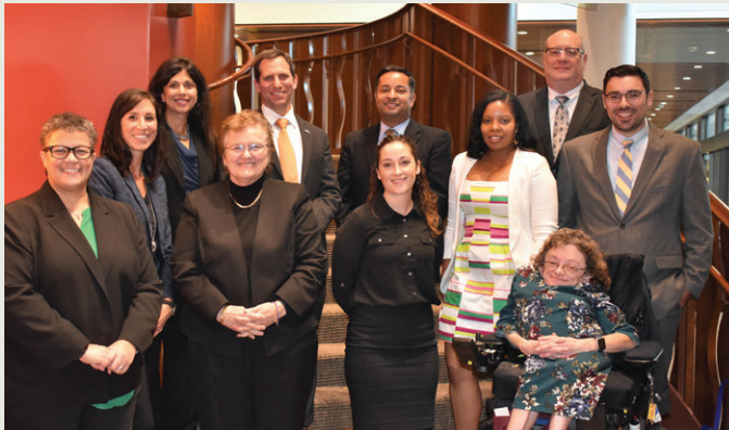
CBA Diversity & Inclusion Summit Committee members.

not just to talk about diversity and inclusion, but to take specific actions to ensure that we are taking the necessary steps to make Connecticut a more diverse and inclusive bench and bar. We hope you will