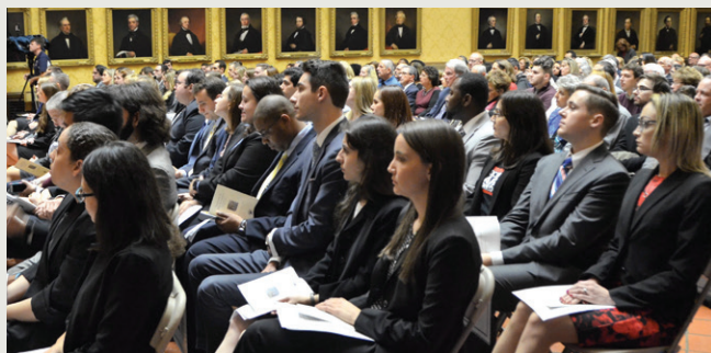
Newly admitted attorneys at this year's Swearing-in Ceremony.

On November 2, nearly 200 new attorneys were sworn in to the Connecticut Bar, where they appeared before the justices of the Connecticut Supreme Court during the morning or afternoon session.