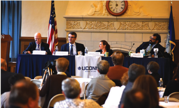
"Ensuring Meaningful Inclusion for Lawyers with Disabilities" panel discussion.

The Connecticut Bar Association (CBA) Diversity and Inclusion Committee and the Connecticut Bar Foundation (CBF) James W. Cooper Fellows presented The Second Annual Diversity and Inclusion Symposium: Achieving Meaningful Diversity and Inclusion for Lawyers and Law Students with Disabilities on September 7 at UConn School of Law. The program focused