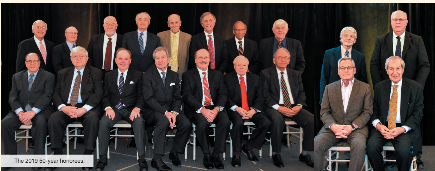
The 2019 50-year honorees.