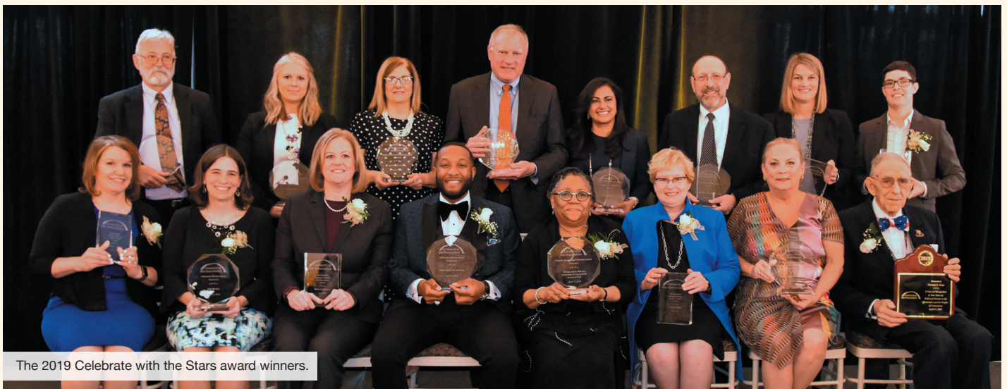
The 2019 Celebrate with the Stars award winners.