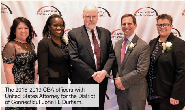
The 2018-2019 CBA officers with United States Attorney for the District of Connecticut John H. Durham.