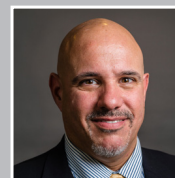
Anthony Maio Real Estate