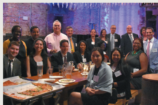
New members, bar leaders, and CBA officers at the New Member Reception at BAR.