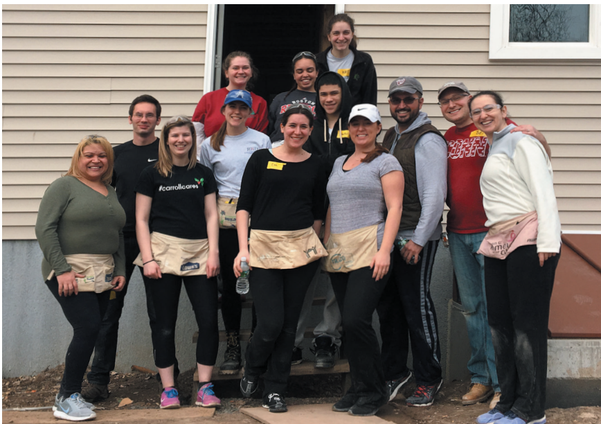
YLS volunteers at the Hartford Habitat for Humanity build.

Members of the Young Lawyers Section (YLS) volunteered with Hartford Area Habitat for Humanity on Saturday, March 30. The volunteers helped build a home by hanging sheetrock and installing insulation, to contribute to Hartford Habitat's mission to provide safe, decent, affordable housing in the Hartford community.