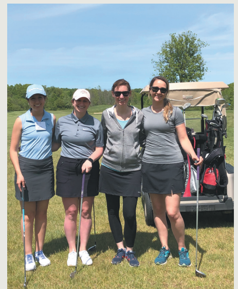
Members enjoying the YLS Annual Women's Professional Golf Event at Lyman Orchards Golf Club in Middlefield.

On May 22, 2019 the Young Lawyers Section Women in the Law Committee presented this year's Annual Women's Professional Golf Event at Lyman Orchards Golf Club in Middlefield. Attendees received tailored golf instruction, networked with other attorneys, enjoyed a luncheon presentation on the value of golf in networking in the legal profession, and had the option to play nine holes.