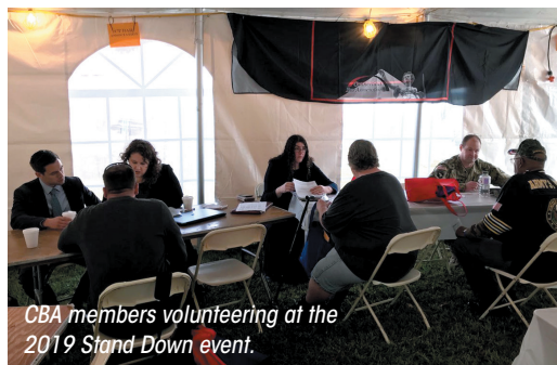
CBA members volunteering at the 2019 Stand Down event.

This year, CBA volunteers assisted more than 50 Connecticut veterans with their legal needs, as well as directed them to where they may receive resolution. Veteran services at this event include anything from hearing screenings to a pop-up courtroom with a superior court judge on hand.