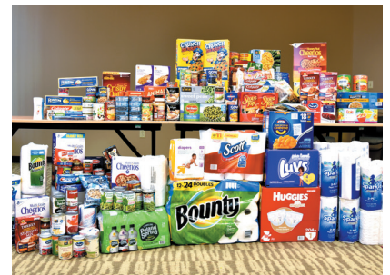
Donations to Connecticut Foodshare provided by attendees of the fall shred trucks events.

This fall, the CBA continued hosting its seasonal shred truck events, where members had the opportunity to bring their files for free, confidential shredding. This season's shred truck events were expanded to include three locations in Fairfield, West Hartford, and New London and were held the first three Wednesdays in November. Young Lawyers Section members and several past and present board officers assisted with the events. Those who registered for the events were encouraged to bring food items and household supplies for donation to Connecticut Foodshare.