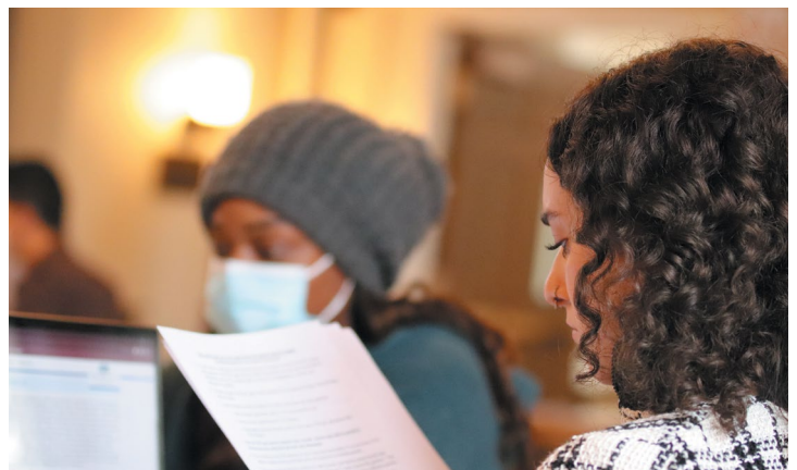
Law students responded to CT Free Legal Answers posts in breakout groups.