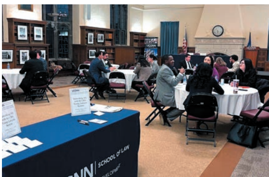
UConn Law students participated in small group discussions during the event.

On February 15, the Young Lawyers Section (YLS) held a student outreach event at the University of Connecticut (UConn) School of Law with current UConn law students. At the event, YLS members and other attorneys discussed the benefits of networking and membership with the CBA. Participants met in small groups to discuss networking strategies and best practices as well as the students' career goals and how best to achieve them.