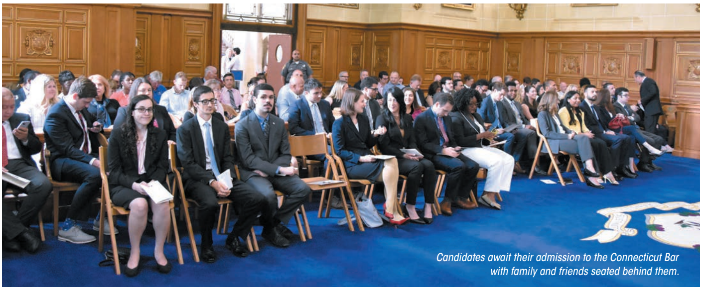
Candidates await their admission to the Connecticut Bar with family and friends seated behind them.

After the ceremony, the newly admitted attorneys were invited to attend a reception held in the Connecticut Supreme Court building's Museum of Connecticut History, where they were able to meet with representatives from the Connecticut Bar Association Young Lawyers Section and other bar associations from across Connecticut.