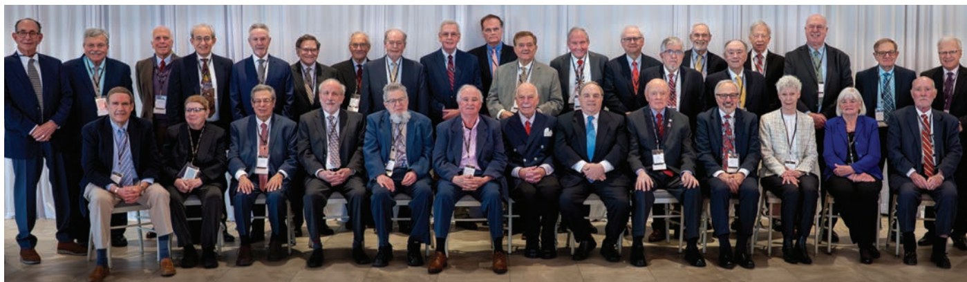
Attorneys Observing the 50th Anniversary of Their Admission to Practice in Connecticut